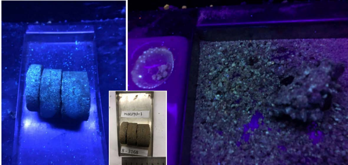
Figure 1 - Side wall core from Mukuyu-1 and cuttings showing fluorescence

As reported in the ASX release on 24 November, additional elevated gas shows and fluorescence were observed through to total depth, proving up the potential of the Upper Angwa formation over a 900-metre gross interval.