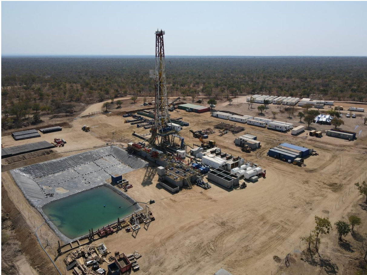
Figure 3 - Exalo Rig 202 at Mukuyu-1 wellsite preparing to commence drilling early September

continued support, and multiple Australian and international institutional investors who continue to back our Cabora Bassa project.”